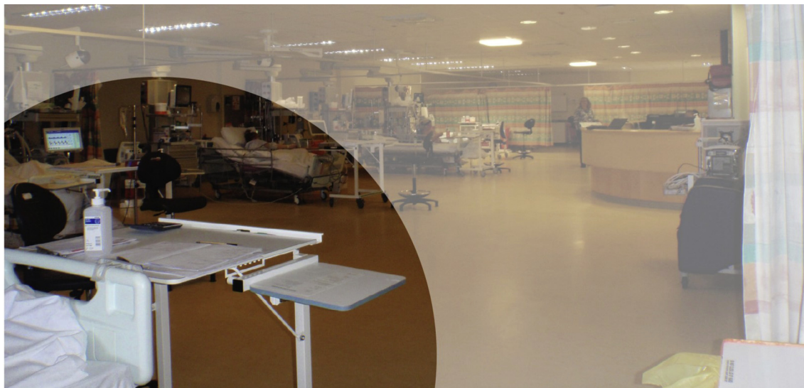
Figure 2. Study intensive care unit (ICU) showing bottle of alcohol gel on a bed table.

Frequently touched near-patient sites would benefit from targeted hygienic cleaning in the critical care environment. 1,3 This may not be a priority in modern ICUs, especially if there are staff shortages or the unit is busy. Any attempt to remove soil will also be compromised by rapidity of recontamination, since some sites become positive for MRSA within 1 h after cleaning. 16 It is tempting to apply powerful disinfectants to these sites, especially those with prolonged effects. However, surface recontamination still occurs even after comprehensive cleaning with disinfectants, including exposure to hydrogen peroxide. 17,18 Ultimately, physical removal of bioburden may be just as effective as disinfectants for controlling microbial soil. 5,8 More work is required to clarify this issue, since, apart from cost issues, detergents are less toxic and unlikely to promote acquisition of antimicrobial resistance genes among environmental bacteria. 19